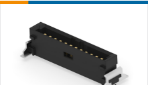
TE Part #294920-E SRCP 1,27 12 M 1 SMD 137 E1 094 * GU-H *