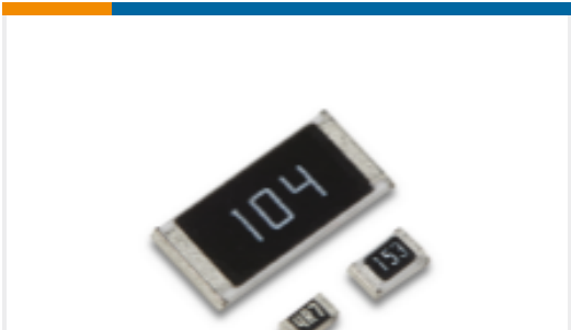
TE Part #4-2176341-8 CRGCQ 0805 82K 1%