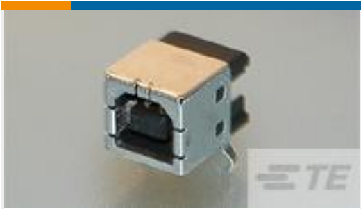
TE Part #292304-4 STD USB TYPE B, R/A, T/H, 15U" AU