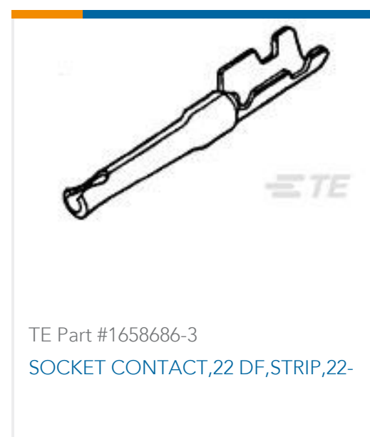
TE Part #1658686-3 SOCKET CONTACT,22 DF,STRIP,22-