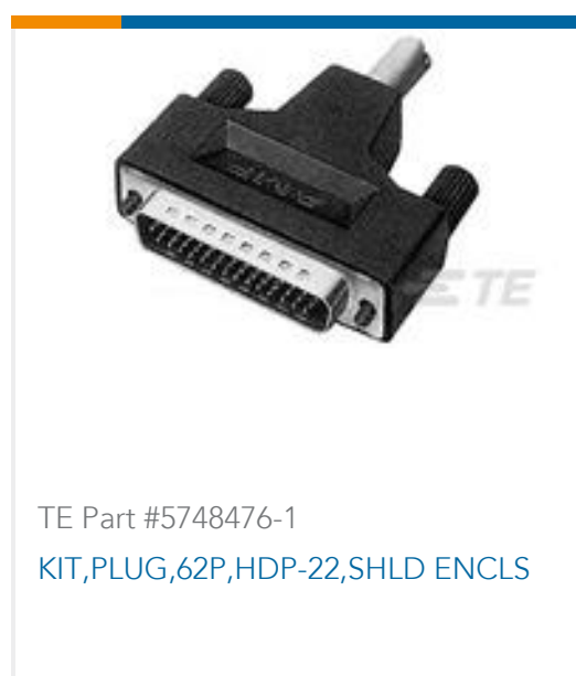
TE Part #5748476-1 KIT,PLUG,62P,HDP-22,SHLD ENCLS