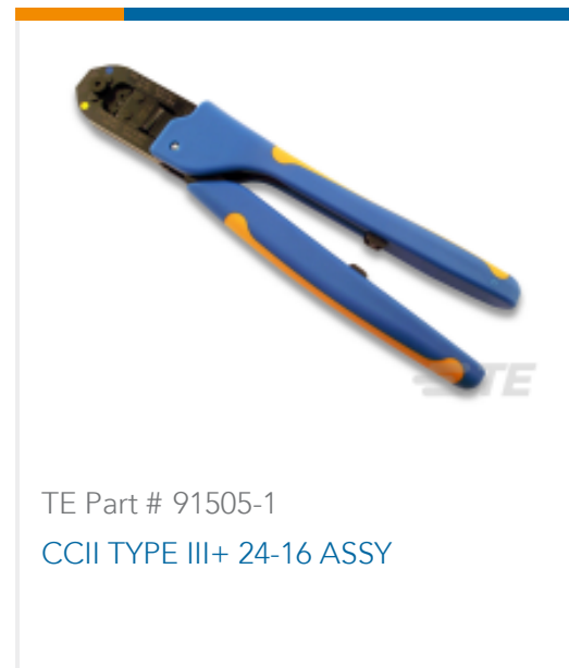
TE Part # 91505-1 CCII TYPE III+ 24-16 ASSY