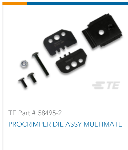
TE Part # 58495-2 PROCRIMPER DIE ASSY MULTIMATE