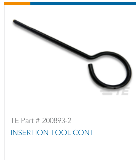
TE Part # 200893-2 INSERTION TOOL CONT