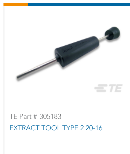
TE Part # 305183 EXTRACT TOOL TYPE 2 20-16