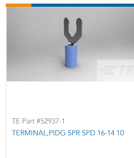
TE Part #52937-1 TERMINAL,PIDG SPR SPD 16-14 10