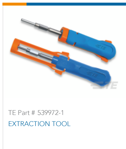
TE Part # 539972-1 EXTRACTION TOOL