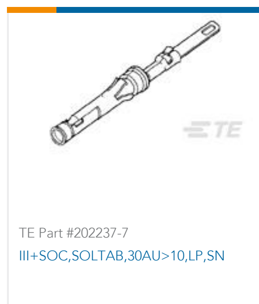
TE Part #202237-7 III+SOC,SOLTAB,30AU>10,LP,SN