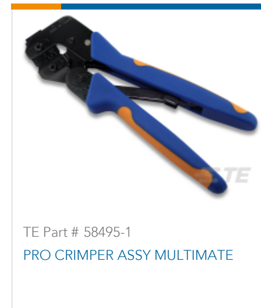
TE Part # 58495-1 PRO CRIMPER ASSY MULTIMATE