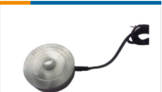
TE Part #FC2311-0000-0250-L FC23 MV 2FT CABLE 250L