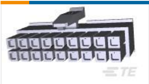
TE Part #1-794617-8 18POS,MICRO MNL,RCPT HSG