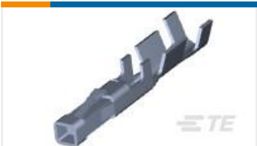
TE Part #1-794606-2 MICRO MNL RPT CNT STRP 30AU LF