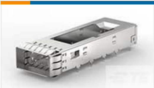
TE Part #2170703-7 CAGE ASSEMBLY, QSFP28 1X1, SPRING