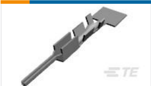
TE Part #1-794608-2 PIN CONT 20-24 30 GOLD STRIP