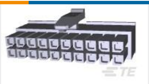
TE Part #2-794617-0 20POS,MICRO MNL,RCPT HSG