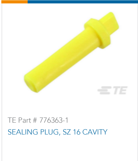
TE Part # 776363-1 SEALING PLUG, SZ 16 CAVITY