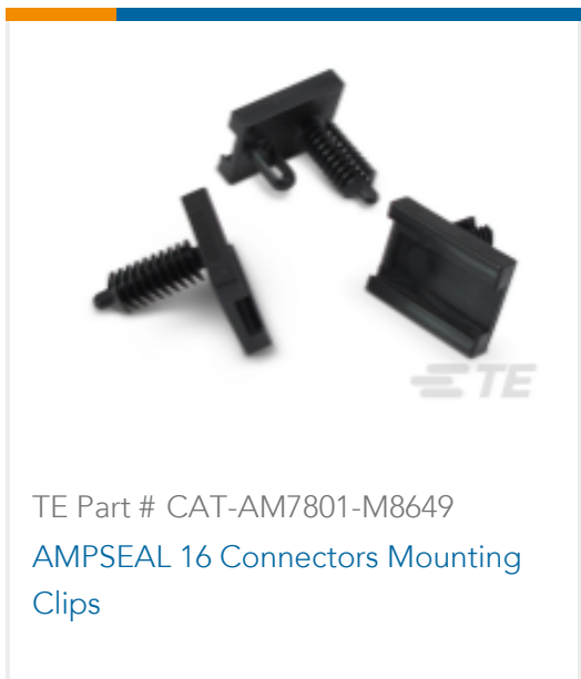
TE Part # CAT-AM7801-M8649 AMPSEAL 16 Connectors Mounting Clips