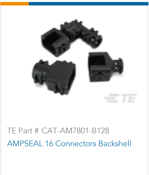
TE Part # CAT-AM7801-B128 AMPSEAL 16 Connectors Backshell