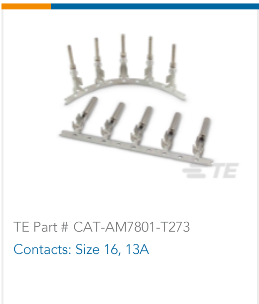
TE Part # CAT-AM7801-T273 Contacts: Size 16, 13A