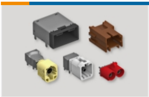
Data Connectivity Headers(2)