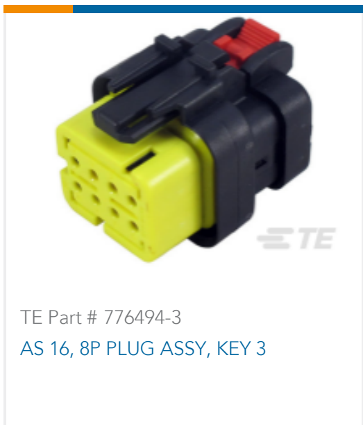
TE Part # 776494-3 AS 16, 8P PLUG ASSY, KEY 3