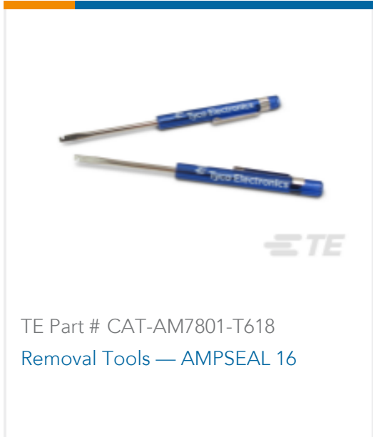
TE Part # CAT-AM7801-T618 Removal Tools — AMPSEAL 16