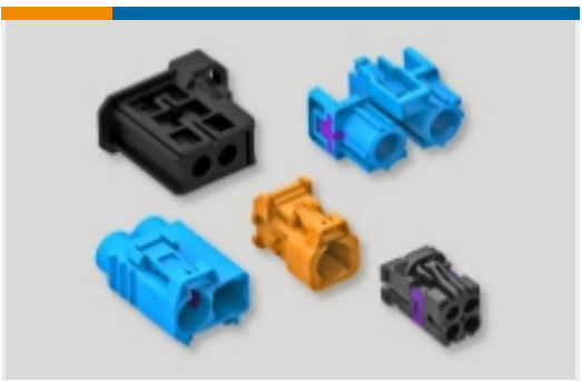
Data Connectivity Housings(3)