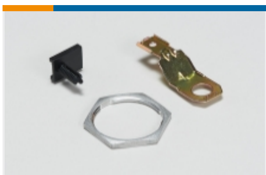
Other Automotive Connector Accessories(11)