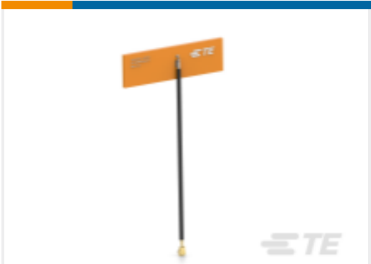
TE Part #2344654-2 WLAN DUAL BAND ANTENNA PCB V 100mm