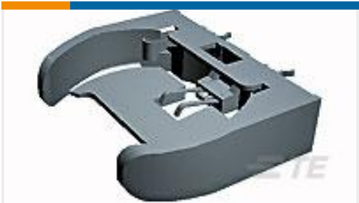
TE Part #1775485-1 Battery Holder, 3.6mm, BLK, low profile