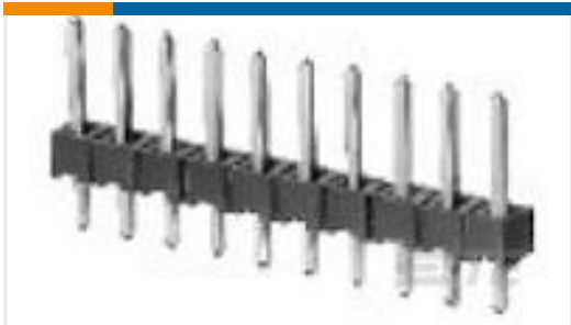
TE Part #5-146277-5 05 MODII HDR SRST B/A .100CL