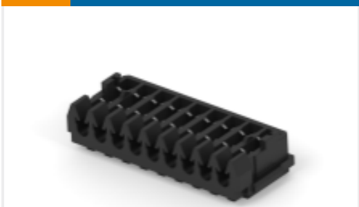
TE Part #2-353293-9 1.5MM CT MT REC ASS'Y 9P BLACK