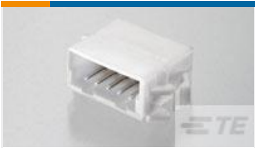
TE Part #292254-8 CT RELAY HDR ASSY 8P NAT