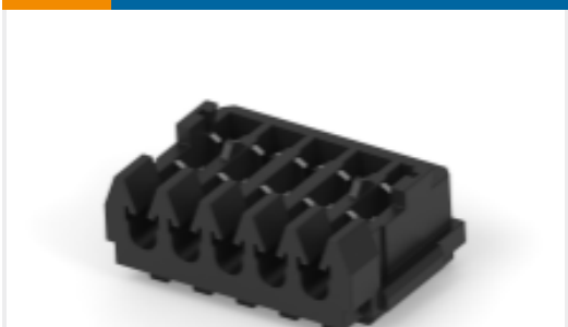
TE Part #2-353293-5 1.5MM CT MT REC ASS'Y 5P BLACK