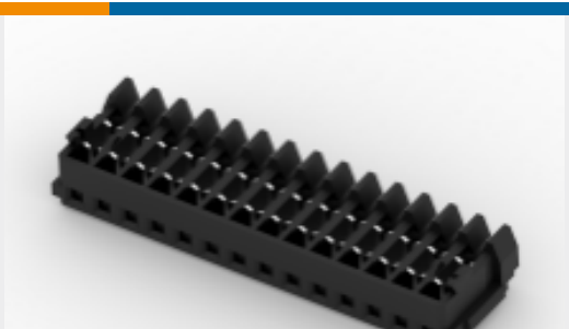
TE Part #3-353293-4 1.5MM CT MT REC ASSY 14P BLACK