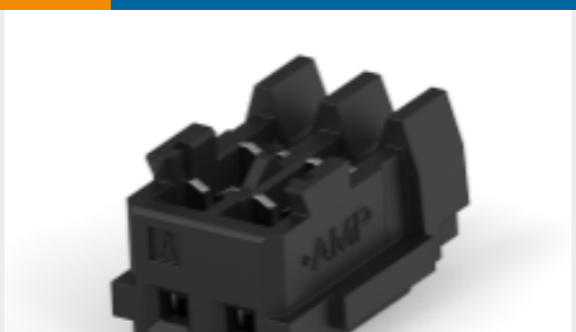
TE Part #2-353293-2 1.5MM CT MT REC ASS'Y 2P BLACK