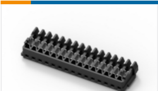
TE Part #3-353293-5 1.5MM CT MT REC ASSY 15P BLACK