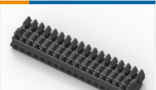
TE Part #3-353293-7 1.5MM CT MT REC ASSY 17P BLACK