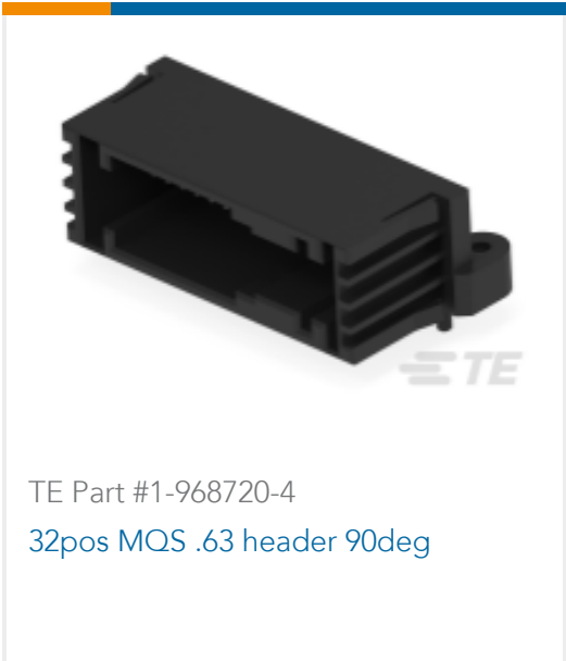
TE Part #1-968720-4 32pos MQS .63 header 90deg

4POS TB HDR 180 DEG, PITCH 3.5, TL 3.4mm