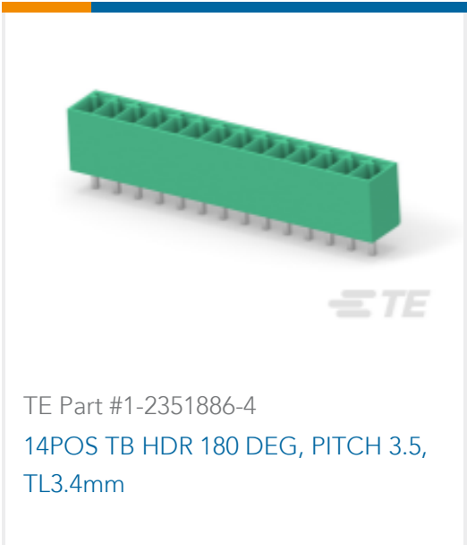
TE Part #1-2351886-4 14POS TB HDR 180 DEG, PITCH 3.5, TL3.4mm