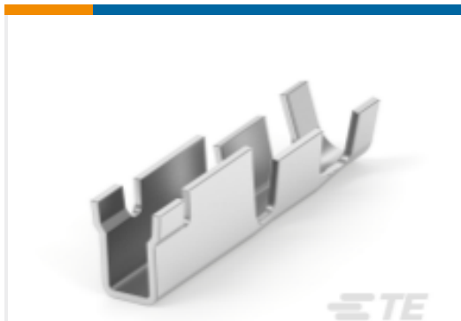
TE Part #62131-9 CLSTR PIN RCPT