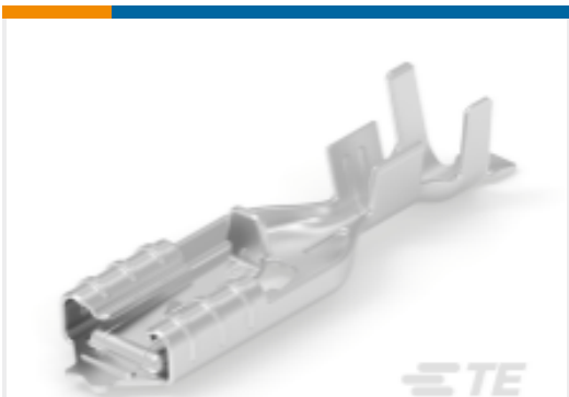
TE Part #2366413-1 187 PL MII REC. 18-16AWG PTBR