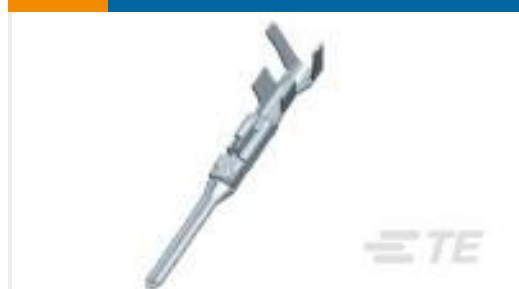
TE Part #175150-2 AMP UNIVE. POWER CONN TAB CONT