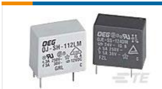
TE Part #1461400-5 OJE-SH-124DM,000