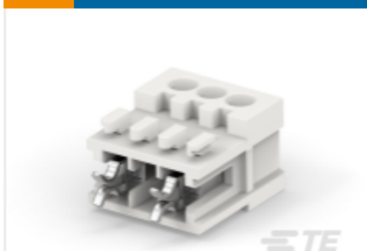
TE Part #1-2232890-3 3P MONOPLUG 2.5 SELECTIVELY LOADED