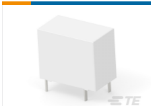
TE Part #1649222-1 OJE-SS-112DM,801