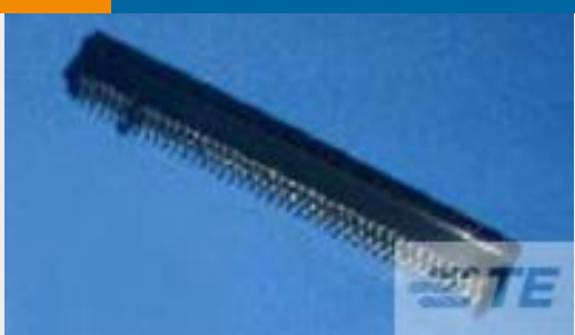
TE Part #5145154-1 CONNECTOR, 60 DUAL POSITION, .