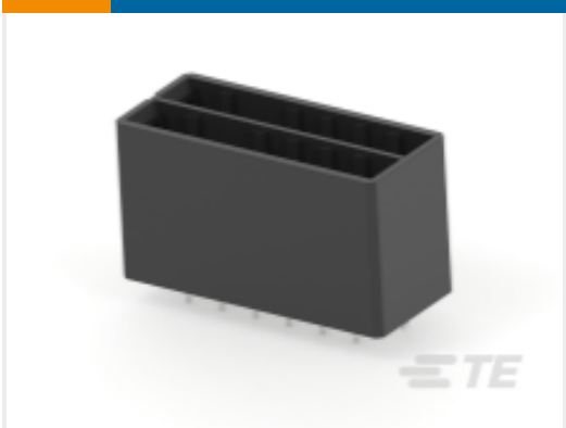
TE Part #3-178140-5 DYNAMIC 3200 HDR ASSY