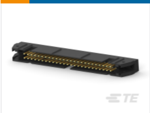
TE Part #5499922-9 AMP-LATCH UNIVERSAL HEADERS