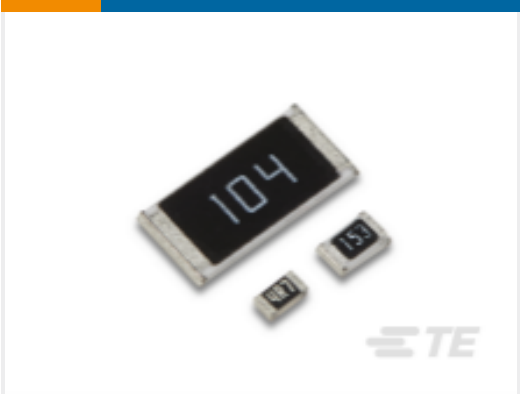
TE Part #4-2176337-5 CRGCQ 0402 47K 1%