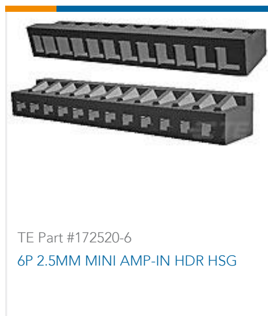
TE Part #172520-6 6P 2.5MM MINI AMP-IN HDR HSG