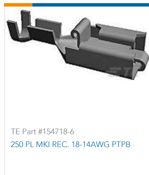
TE Part #154718-6 250 PL MKI REC. 18-14AWG PTPB