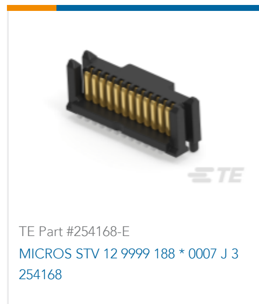
TE Part #254168-E MICROS STV 12 9999 188 * 0007 J 3 254168