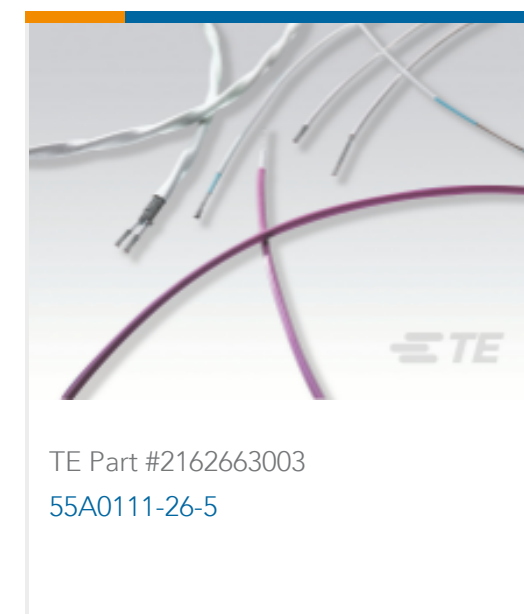
TE Part #2162663003 55A0111-26-5