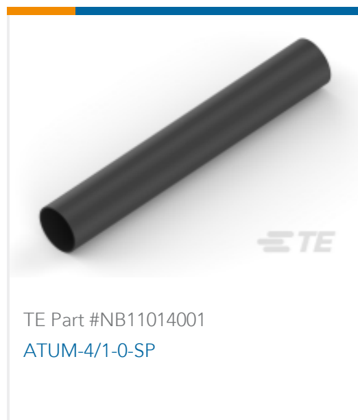
TE Part #NB11014001 ATUM-4/1-0-SP