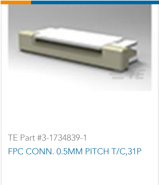
TE Part #3-1734839-1 FPC CONN. 0.5MM PITCH T/C,31P