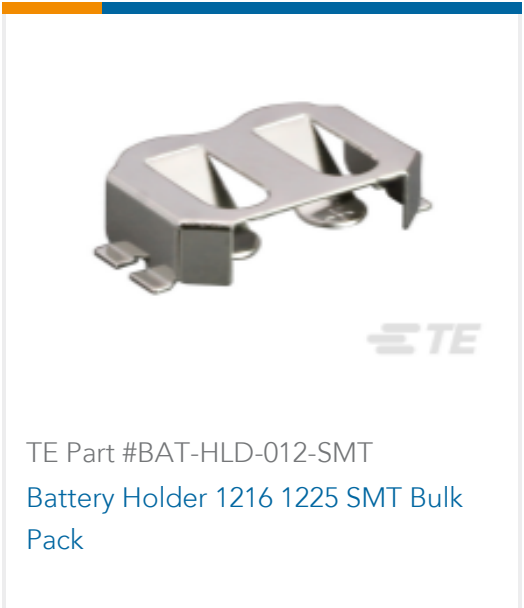
TE Part #BAT-HLD-012-SMT Battery Holder 1216 1225 SMT Bulk Pack