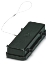
Protective cover B24, for double locking latch, protective cover material: PA, height: 21.6 mm, seal: yes

Please be informed that the data shown in this PDF document is generated from our online catalog. Please find the complete data in the user documentation. Our general terms of use for downloads are valid.