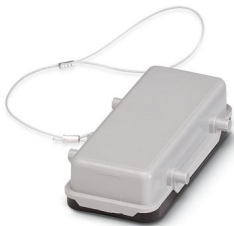
Protective cover B16, for double locking latch, protective cover material: PA, height: 21.6 mm, seal: yes, with lanyard

Please be informed that the data shown in this PDF document is generated from our online catalog. Please find the complete data in the user documentation. Our general terms of use for downloads are valid.