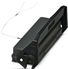
Protective cover B24, with single locking latch, protective cover material: PA, height: 21.6 mm, seal: yes

Please be informed that the data shown in this PDF document is generated from our online catalog. Please find the complete data in the user documentation. Our general terms of use for downloads are valid.