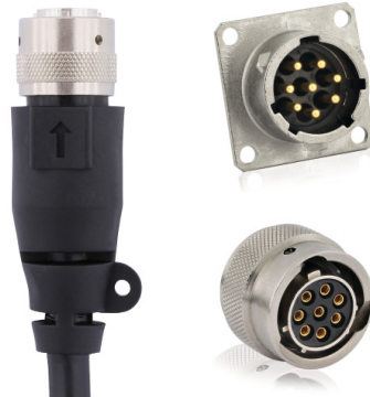
Robust Metal & Shielded UTO Series