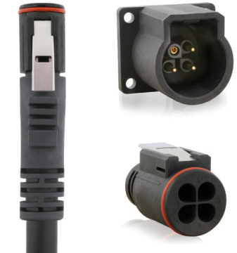
Intensive Mating / Unmating UTL

Please contact us for more information and details on our comprehensive offering of standard or custom overmolded cable assemblies.