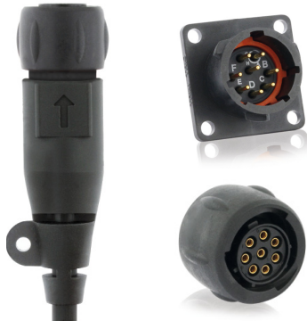
Waterproof Plastic UTS Series