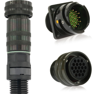
Highly Rugged Metal UTV Series