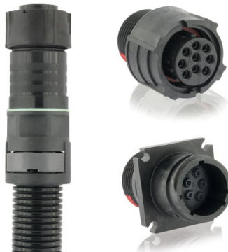
Versatile Rugged Plastic Clipper Series