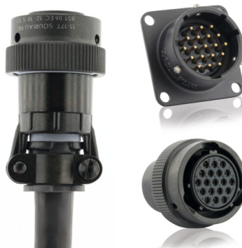
Diverse series of Heavy-Duty 851 Series