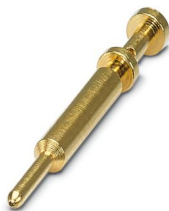
Crimp contact, Pin, turned, contact diameter: 1 mm, crimp range: 0.34 mm 2 ... 0.5 mm 2

Please be informed that the data shown in this PDF document is generated from our online catalog. Please find the complete data in the user documentation. Our general terms of use for downloads are valid.