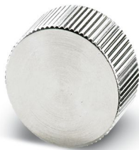
Metal protective cap, M17, degree of protection: IP67, series: ST, Alternative product in accordance with RoHS II without Exemption 6c (Pb < 0.1 %) item no.: 1243010

Please be informed that the data shown in this PDF document is generated from our online catalog. Please find the complete data in the user documentation. Our general terms of use for downloads are valid.