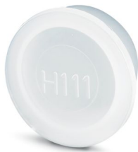
Plastic protection cap for connectors with M17 compact knurled nut and M17 compact SPEEDCON knurled nut

Please be informed that the data shown in this PDF document is generated from our online catalog. Please find the complete data in the user documentation. Our general terms of use for downloads are valid.