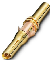
Crimp contact, turned, contact diameter: 1 mm, crimp range: 0.14 mm 2 ... 0.75 mm 2

Please be informed that the data shown in this PDF document is generated from our online catalog. Please find the complete data in the user documentation. Our general terms of use for downloads are valid.