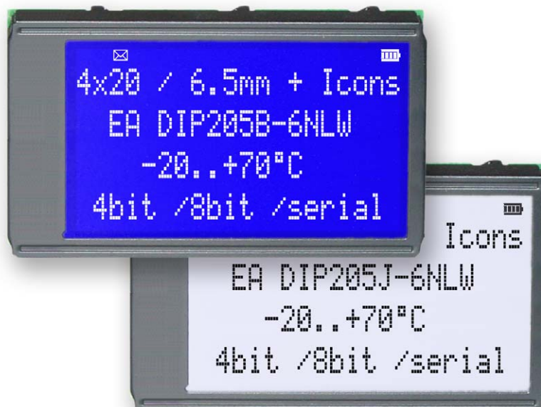
EA DIP205J-6NLW: Dimension 75 x 46 mm