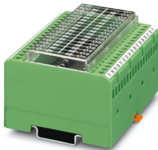
Diode module, for extension with 32 1N 4007 diodes, common cathode

Please be informed that the data shown in this PDF document is generated from our online catalog. Please find the complete data in the user documentation. Our general terms of use for downloads are valid.