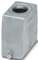
Sleeve housing B16, for single locking latch, material: Die-cast aluminum, salt water resistant, cable outlets: 1, straight, 1x M40, height: 76 mm, cable gland: none, Standard

Please be informed that the data shown in this PDF document is generated from our online catalog. Please find the complete data in the user documentation. Our general terms of use for downloads are valid.