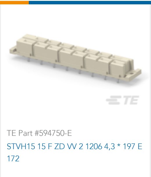
TE Part #594750-E STVH15 15 F ZD VV 2 1206 4,3 * 197 E 172