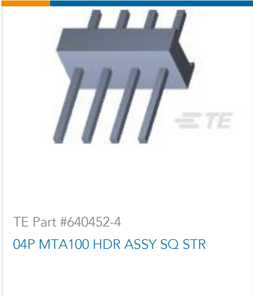
TE Part #640452-4 04P MTA100 HDR ASSY SQ STR