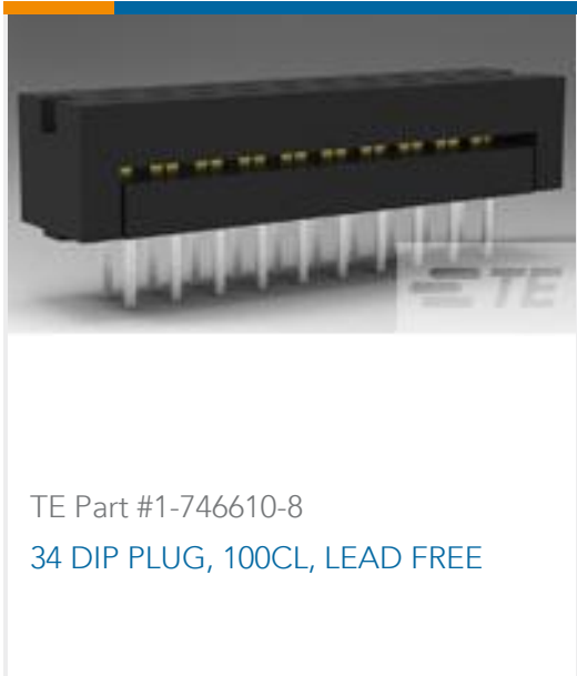
TE Part #1-746610-8 34 DIP PLUG, 100CL, LEAD FREE