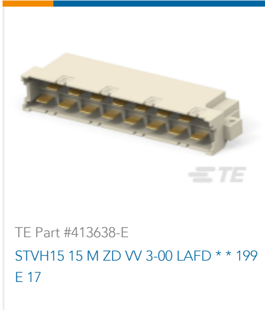
TE Part #413638-E STVH15 15 M ZD VV 3-00 LAFD ** 199 E 17