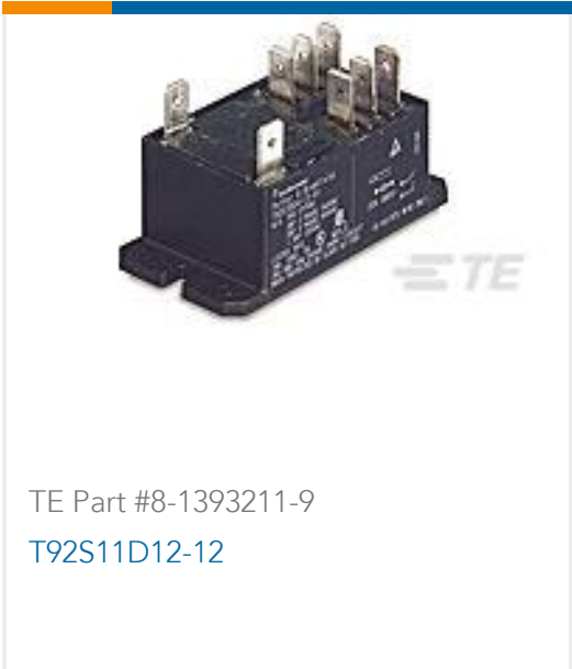
TE Part #8-1393211-9 T92S11D12-12