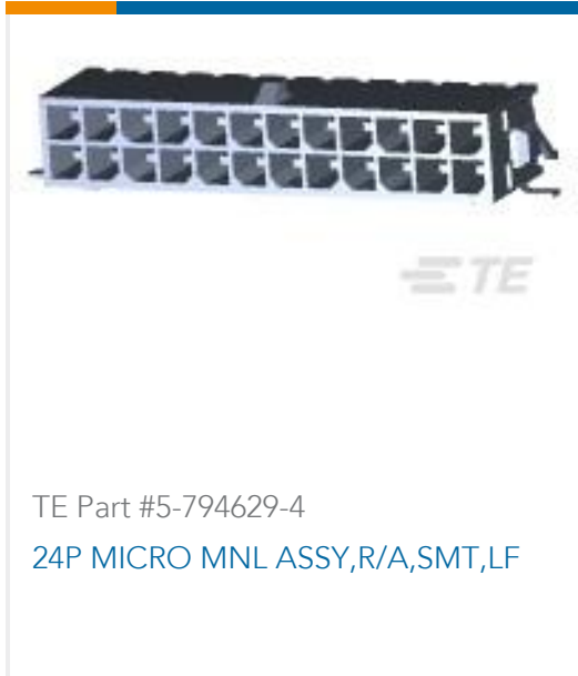
TE Part #5-794629-4 24P MICRO MNL ASSY,R/A,SMT,LF