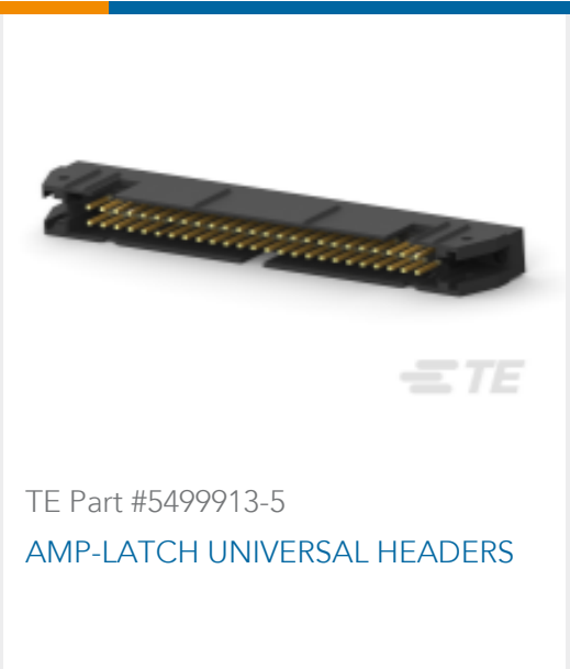
TE Part #5499913-5 AMP-LATCH UNIVERSAL HEADERS