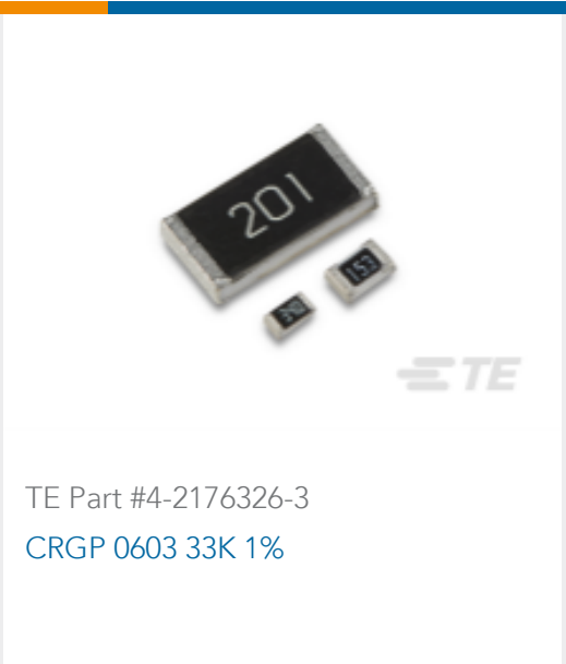
TE Part #4-2176326-3 CRGP 0603 33K 1%