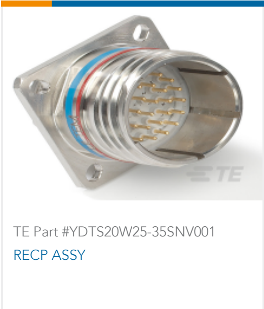
TE Part #YDTS20W25-35SNV001 RECP ASSY