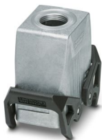
Sleeve housing B10, with double locking latch, material: Die-cast aluminum, salt water resistant, cable outlets: 1, straight, 1x M25, height: 72 mm, cable gland: none, Standard

Please be informed that the data shown in this PDF document is generated from our online catalog. Please find the complete data in the user documentation. Our general terms of use for downloads are valid.