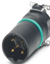
Contact carrier, 5-position, Pin, straight, M12, coding: B, PCB mounting, SMD reflow, Alternative product in accordance with RoHS II without Exemption 6c (Pb < 0.1 %) item no.: 1308055

Please be informed that the data shown in this PDF document is generated from our online catalog. Please find the complete data in the user documentation. Our general terms of use for downloads are valid.