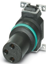
Contact carrier, 3-position, Socket, straight, M8, coding: A, PCB mounting, SMD reflow, Alternative product in accordance with RoHS II without Exemption 6c (Pb < 0.1 %) item no.: 1308271

Please be informed that the data shown in this PDF document is generated from our online catalog. Please find the complete data in the user documentation. Our general terms of use for downloads are valid.