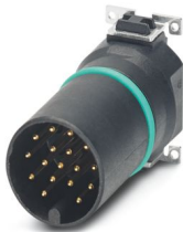
Contact carrier, 17-position, Pin, straight, M12, coding: A, PCB mounting, SMD reflow, Alternative product in accordance with RoHS II without Exemption 6c (Pb < 0.1 %) item no.: 1238930

Please be informed that the data shown in this PDF document is generated from our online catalog. Please find the complete data in the user documentation. Our general terms of use for downloads are valid.