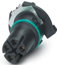
Contact carrier, Power, 4-position, Socket, straight, M12, coding: L, PCB mounting, THR solder connection

Please be informed that the data shown in this PDF document is generated from our online catalog. Please find the complete data in the user documentation. Our general terms of use for downloads are valid.