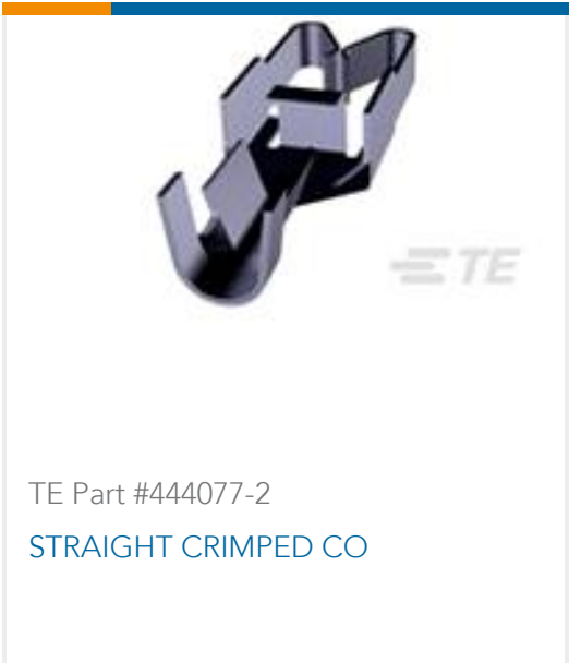
TE Part #444077-2 STRAIGHT CRIMPED CO