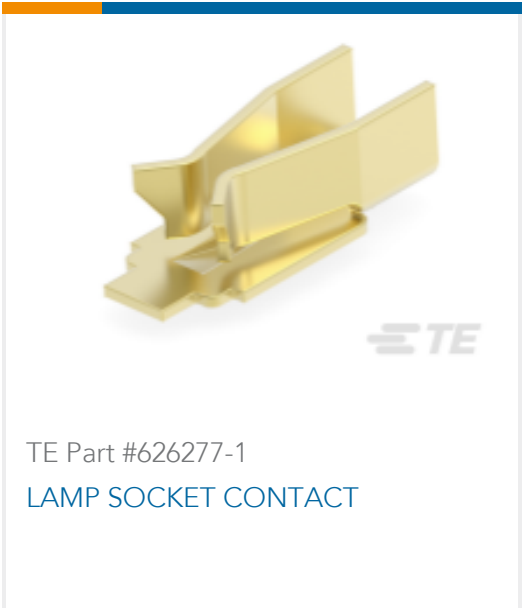
TE Part #626277-1 LAMP SOCKET CONTACT