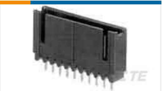
TE Part #5-102202-1 04 MODII HDR SRST SHRD LF