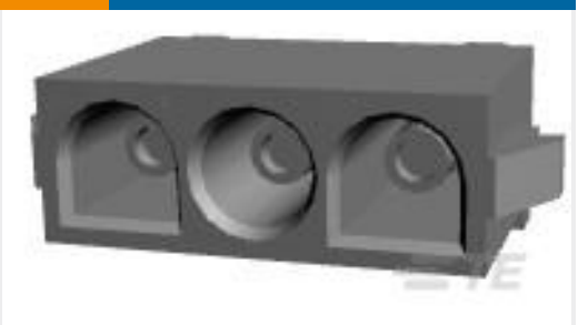
TE Part #350825-1 03P UMNL HDR ASSY PC 94VO