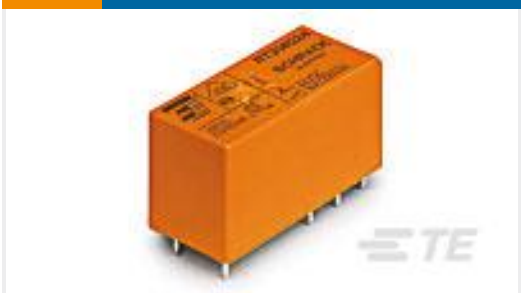
TE Part #1393240-7 RT314730