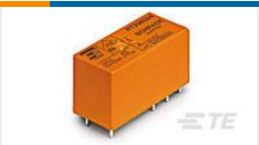
TE Part #9-1393243-7 RT444012