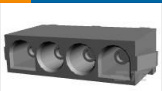
TE Part #350826-1 04P UMNL HDR ASSY PC 94VO