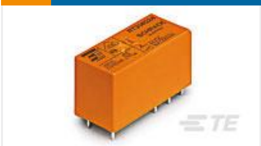
TE Part #5-1393238-6 RTD1L012