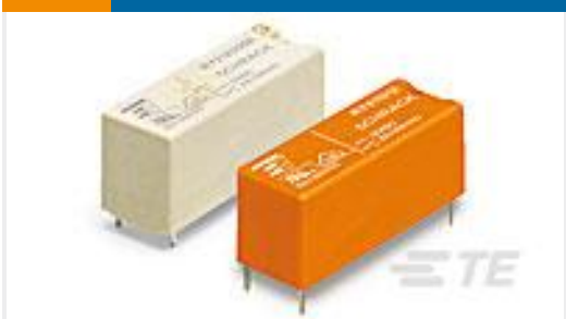
TE Part #6-1393224-1 RY213012