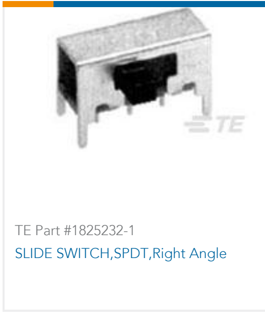
TE Part #1825232-1 SLIDE SWITCH,SPDT,Right Angle