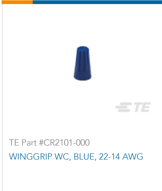
TE Part #CR2101-000 WINGGRIP WC, BLUE, 22-14 AWG