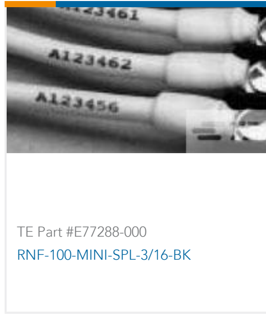
TE Part #E77288-000 RNF-100-MINI-SPL-3/16-BK