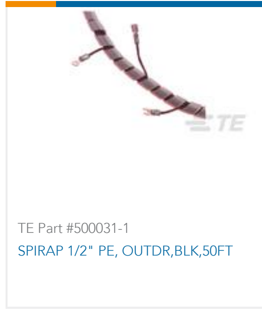
TE Part #500031-1 SPIRAP 1/2" PE, OUTDR,BLK,50FT