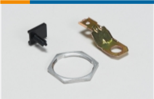
Other Automotive Connector Accessories(1)