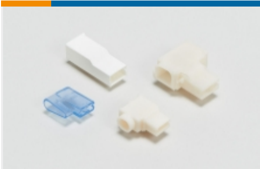
Crimp Terminal Housings(13)