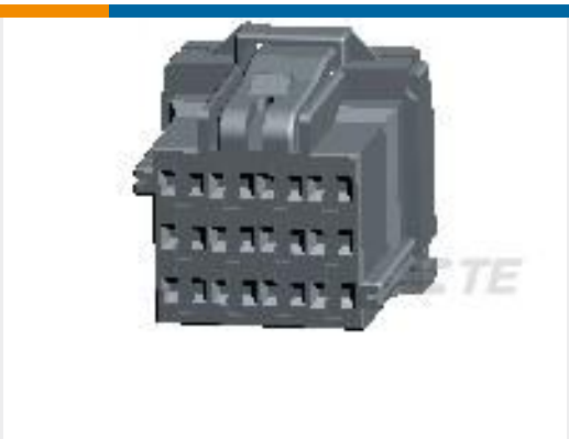
TE Part #8-968972-1 MCP 2.8 GEH 12P