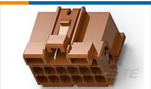
TE Part #3-967624-6 JUN-POW-TIM GEH 18P