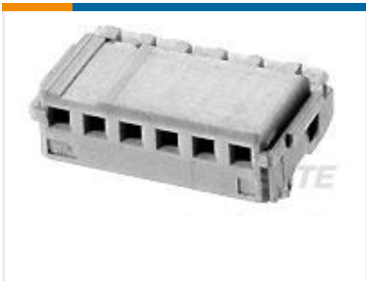
TE Part #1-353908-5 CT REC HSG 15P CRIMP TYPE WHIT