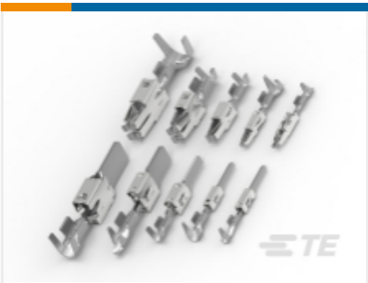
TE Part #925590-2 TIMER, RECEPTACLE AND TAB