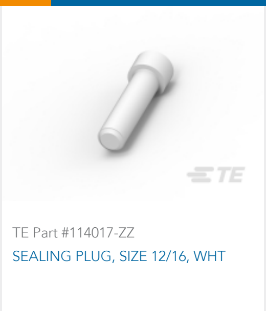
TE Part #114017-ZZ SEALING PLUG, SIZE 12/16, WHT