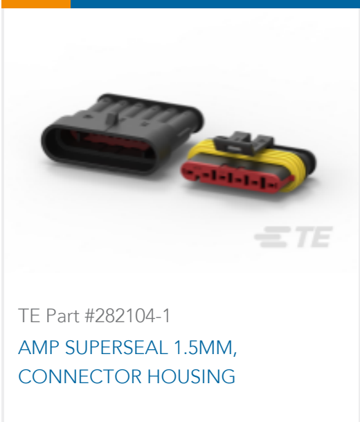
TE Part #282104-1 AMP SUPERSEAL 1.5MM, CONNECTOR HOUSING