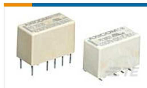
TE Part #4-1393789-5 V23079D2003B301