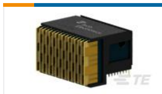
TE Part #2102771-2 Plug Assy, R Angle, 7Row, Cnt, MG, RUG