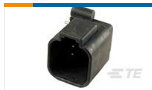
TE Part #DTF13-6P HDR, 6P, BLK, RA, SN/NI/CU