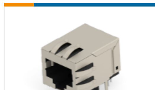
TE Part #203189-E MJIM IM 1X1 S 810 GF5 X R THRU ** M5B01