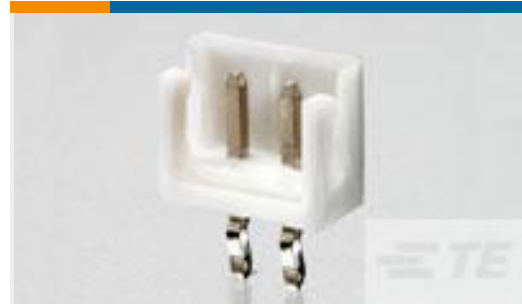
TE Part #440052-3 2.5MM, HDR, 3POS, VERTICAL, CONNECTOR