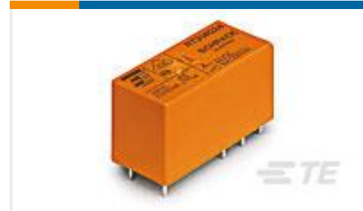
TE Part #6-1393238-2 RTD14012