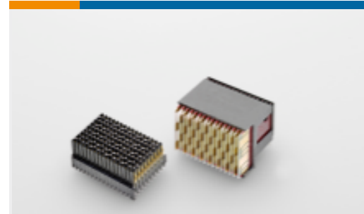
TE Part #2302790-1 VERTRECCASSY, RIGHTEND, MULTIGIG RT3