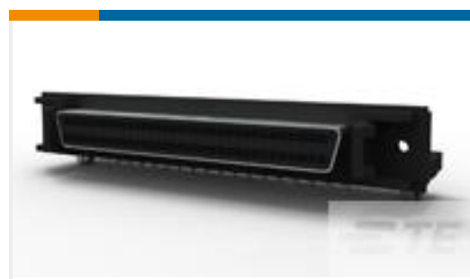
TE Part #1761028-4 68 50SR R/A RCPT ASSY, LEAD FREE