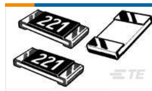
TE Part #6-2176231-5 3522 4K7 1% 3W