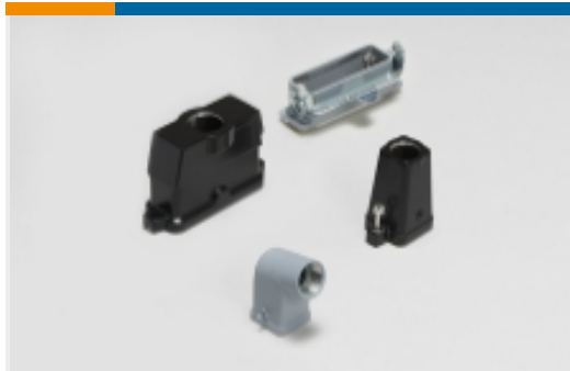
Rectangular Connector Hoods & Bases (1258)