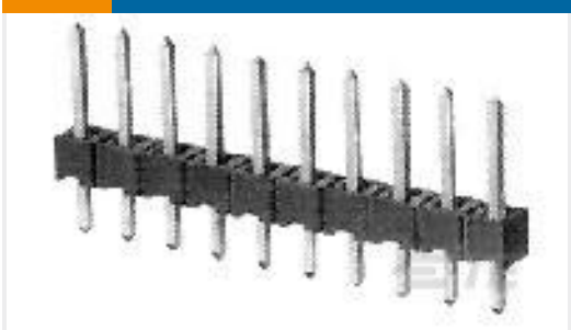
TE Part #826629-2 2P AMPMODU II