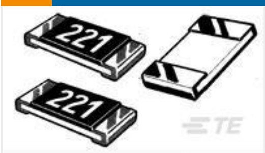
TE Part #8-2176230-0 3522 3M3 5% 3W