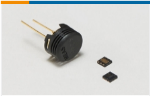
Humidity Sensor Components(1)