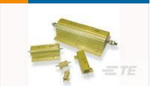
TE Part #5-1630019-1 HSC200 24R 5%