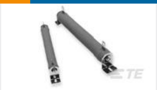
TE Part #1879455-2 TE 1500W 1R2 5% Bracket