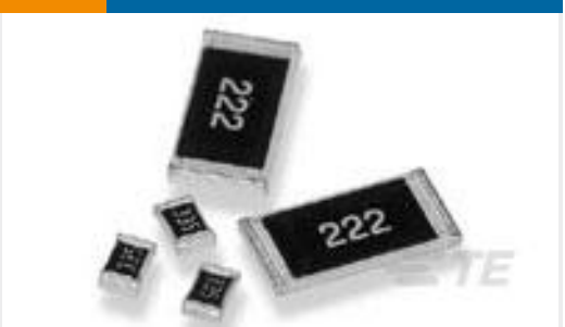
TE Part #1623517-1 CRG1206 1% 470R