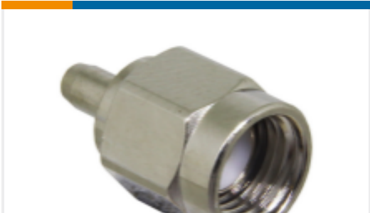
TE Part #CONREVSMA007-R178 RP-SMA Plug 50 Ohm Cable Crimp