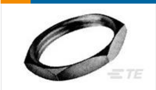
TE Part #1-329631-2 JAM NUT, PLATED