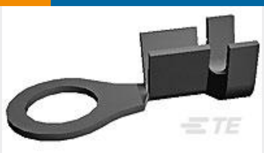
TE Part #160101-2 RING TONGUE 20-16 AWG 0.0253 TPBR