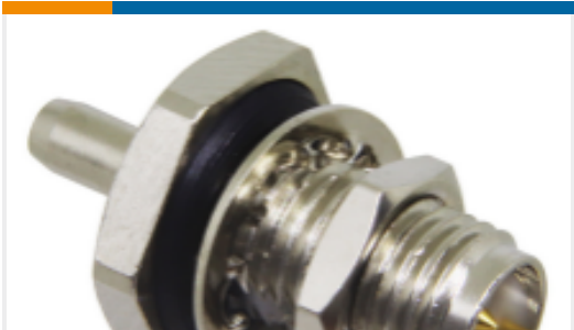
TE Part #CONREVSMA014-R178 RP-SMA Jack 50 Ohm Panel Mount Crimp