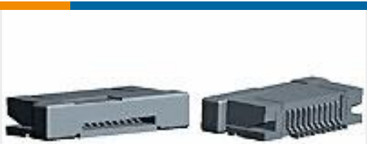
TE Part #3-1734592-1 FPC CONN. 0.5MM PITCH B/C, 31P