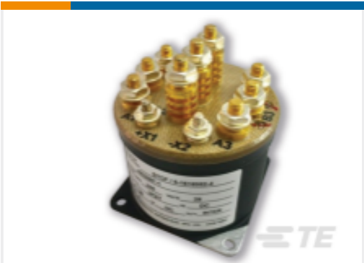
TE Part #5-1616982-4 D7CF=3PDT STARTER CONTACTOR