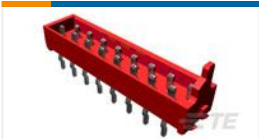
TE Part #215464-8 08P.MICRO-MATCH MOB