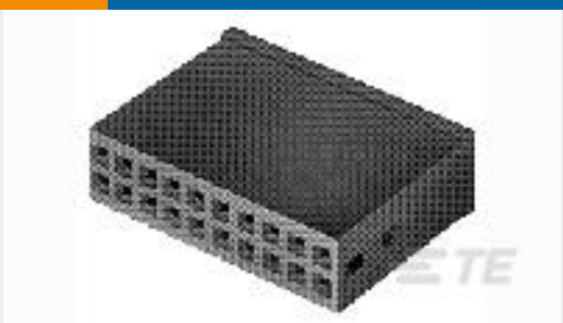
TE Part #5-925369-0 MOD.HSG 50 P.