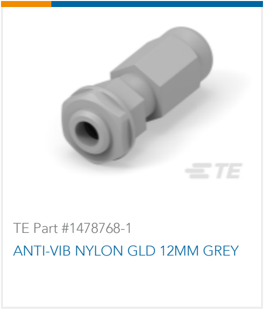
TE Part #1478768-1 ANTI-VIB NYLON GLD 12MM GREY