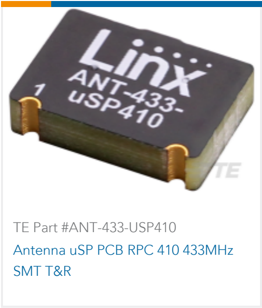
TE Part #ANT-433-USP410 Antenna uSP PCB RPC 410 433MHz SMT T&R