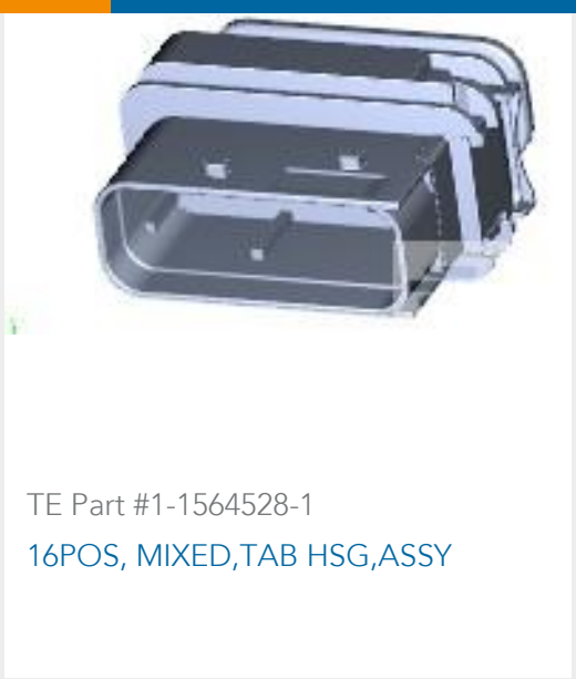
TE Part #1-1564528-1 16POS, MIXED,TAB HSG,ASSY