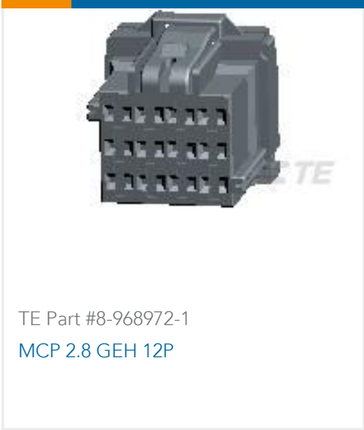
TE Part #8-968972-1 MCP 2.8 GEH 12P