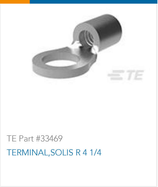
TE Part #33469 TERMINAL,SOLIS R 4 1/4