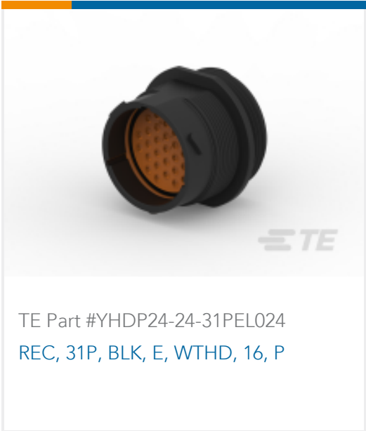
TE Part #YHDP24-24-31PEL024 REC, 31P, BLK, E, WTHD, 16, P