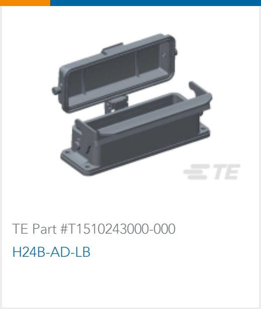
TE Part #T1510243000-000 H24B-AD-LB