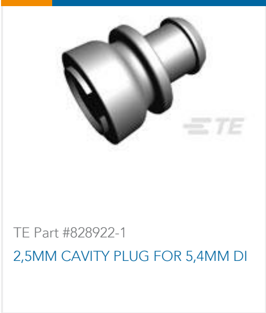
TE Part #828922-1 2,5MM CAVITY PLUG FOR 5,4MM DI