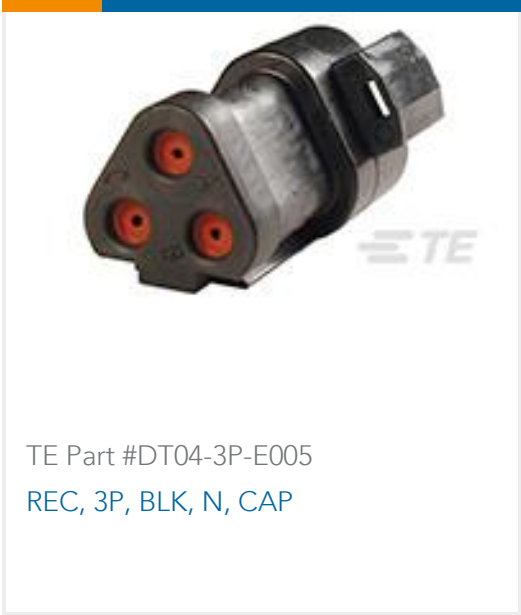
TE Part #DT04-3P-E005 REC, 3P, BLK, N, CAP