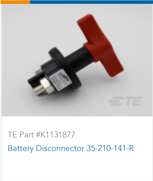
TE Part #K1131877 Battery Disconnect 35-210-141-R