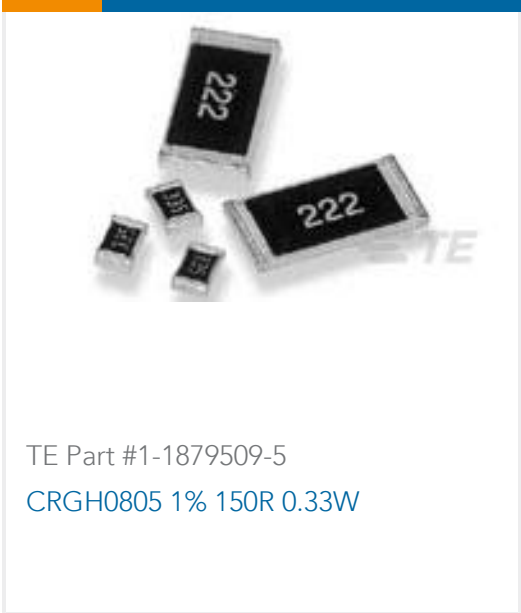
TE Part #1-1879509-5 CRGH0805 1% 150R 0.33W