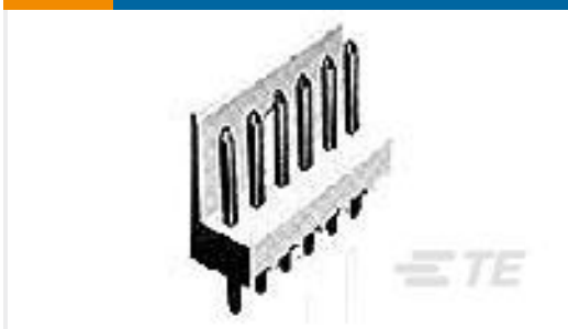
TE Part #171825-4 TYPE V EIS CONNECTOR 4P ASSY