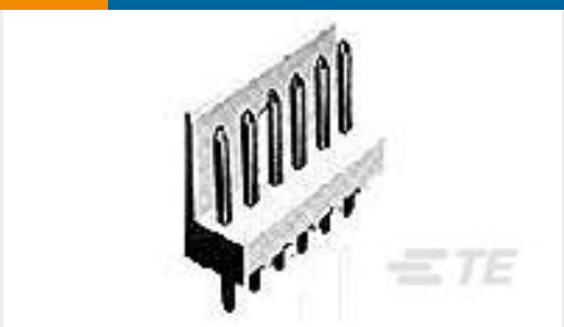
TE Part #171825-5 5 POS EIS POST HDR