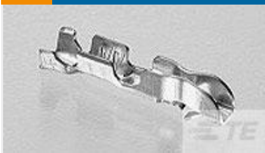
TE Part #170204-1 EIS RECPT CONTACT