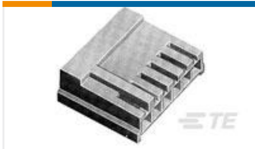
TE Part #171822-5 EIS REC. HSG 5P-NATURAL