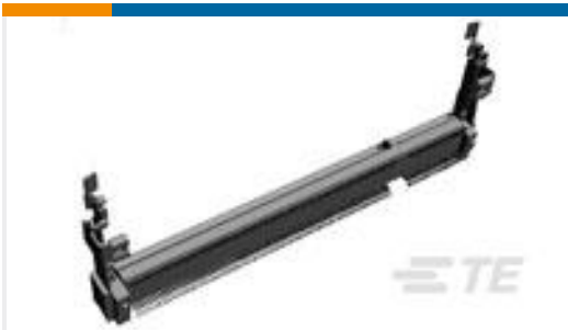
TE Part #1717468-3 SEMI-HARD TRAY DDR SODIMM SOCKET 200P 6