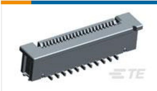
TE Part #1-1734742-2 .5 FPC VT ZIF Type-A 12 CONT