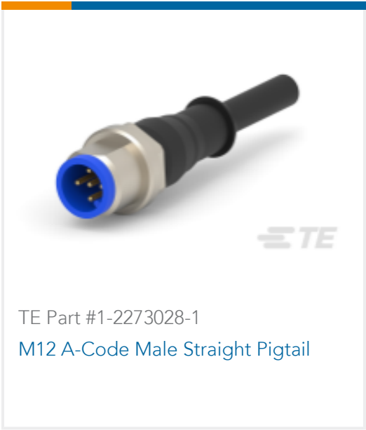
TE Part #1-2273028-1 M12 A-Code Male Straight Pigtail