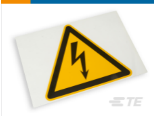
TE Part #1-1768020-5 ESSW41-052