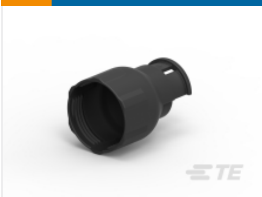
TE Part #2428-025-1805 BKSHL, 18SZ, BLK, ST, L024, HDP