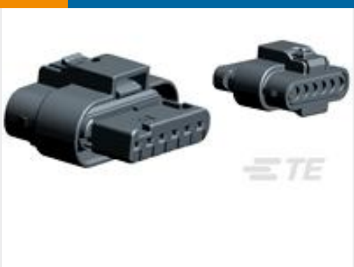
TE Part #1924292-5 6POS, MCON 1.2 CB REC 2p TL SEALED