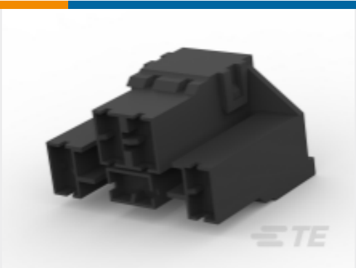
TE Part #927529-1 5P POS LOCK GEH

Product Drawings REC, 32P, BLK, E, FLANGE, A English