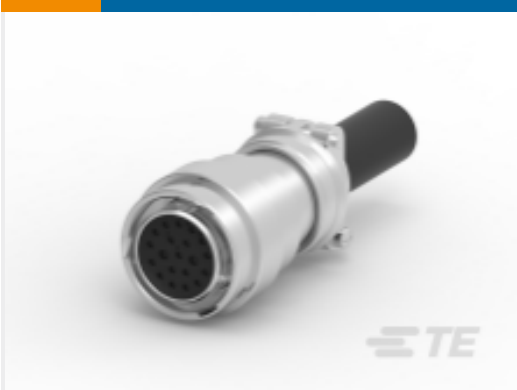
TE Part #HD36-18-20SN-059 PLG,20P,AL,N,CBLCLMP BT,DRAIN,16 /20,S,MC