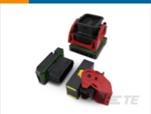
TE Part #SRK06-MDB-32A-001 DEUTSCH Strike Housings