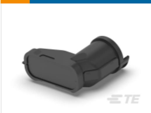
TE Part #SRK-BS-MD-ST-001 BKSHL, MED, BLK, ST, NW 17/22