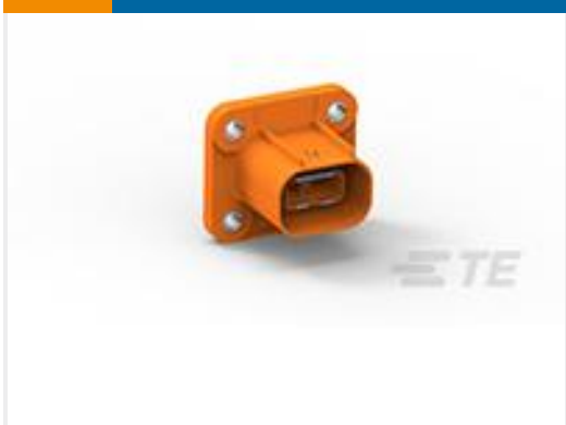
TE Part #2103124-2 HVA280 2P HEADER ASSY, KEY B