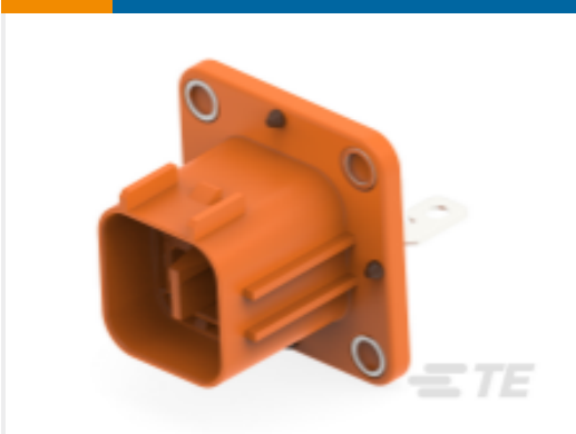
TE Part #1-2141272-6 2POS, MIXED,HEADER ASSY,CODF