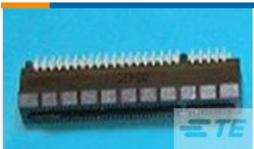
TE Part #5650118-1 CONN SEC II 15 POS 100C/L R/A