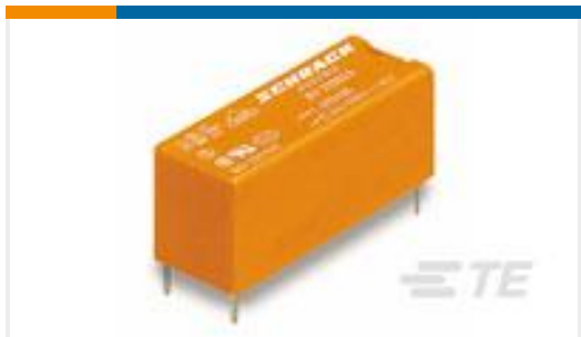
TE Part #4-1393224-5 RY211009