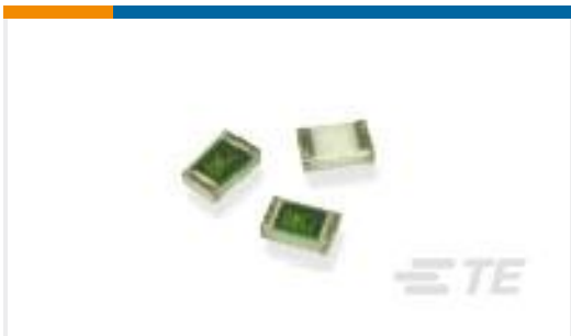
TE Part #1676193-2 RN 0805 150K 0.1% 10PPM 1KRL