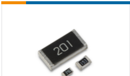
TE Part #2-2176328-4 CRGP 1206 820R 1%