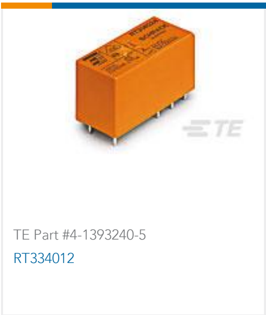
TE Part #4-1393240-5 RT334012