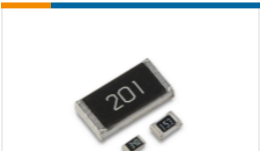
TE Part #2-2176329-7 CRGP 1210 1K5 1%