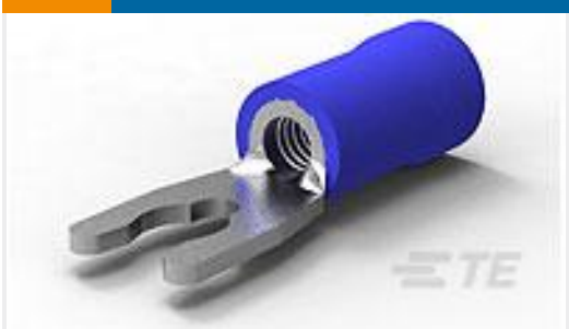
TE Part #52955 TERMINAL,PG SPR SPD 16-14 6