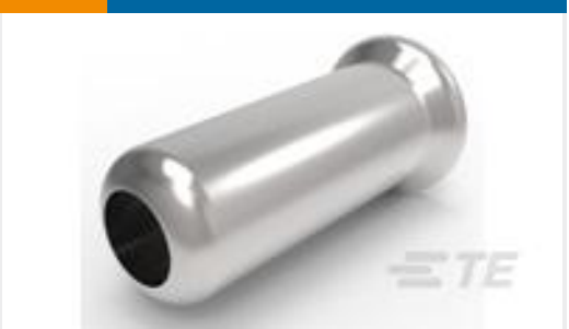
TE Part #1-50871-8 SOCKET,MIN-SPR W/H AU SER-5