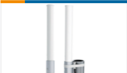
TE Part #OC69271-FNF OMNI,DBAND,FIXED,NF 698-960MHz, 1.5dBi