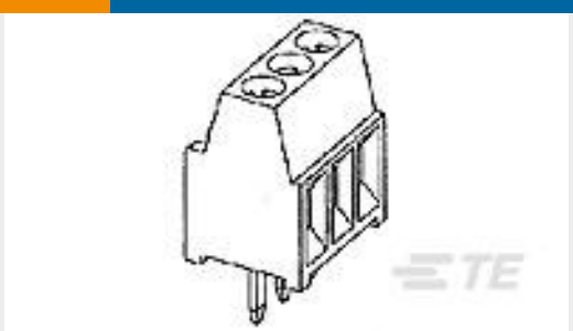
TE Part #1-282834-2 TERMI-BLOK PCB MOUNT, 90 12P.