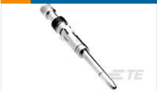
TE Part #202507-1 CONTACT PIN ASSY.