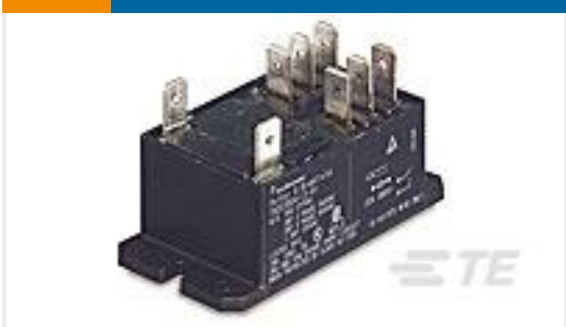
TE Part #6-1393211-2 T92P7A22-240