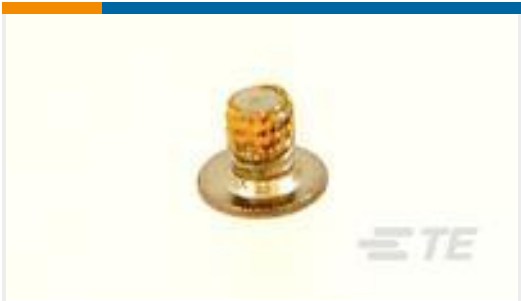
TE Part #1410946-2 MULTI-GIG SOC. CAP SCREW, CUSTOMIZED HDW