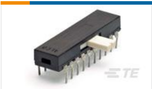
TE Part #1825010-1 ASE2204=DPDT AUTOSLIDE