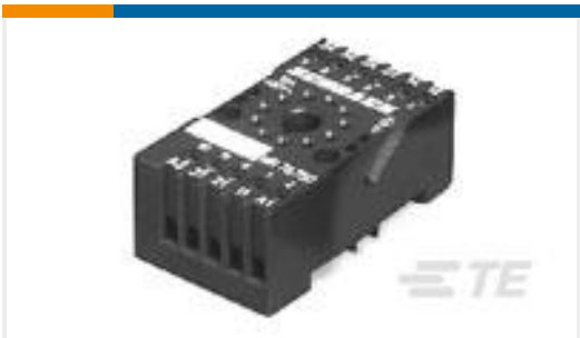
TE Part #3-1415035-1 MT78755