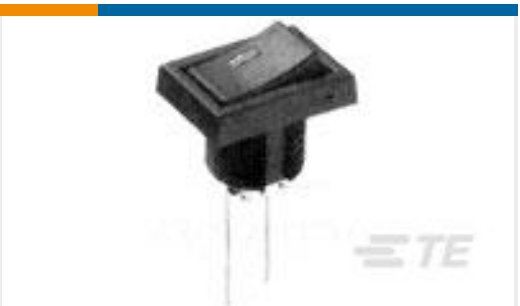
TE Part #1825420-1 TRD13D10WL04 rocker switch