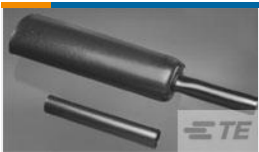
TE Part #934922-000 RMW-75/22-1200/ADH-0

This information is provided based on reasonable inquiry of our suppliers and represents our current actual knowledge based on the information they provided. This information is subject to change. The part numbers that TE has identified as EU RoHS compliant have a maximum concentration of 0.1% by weight in homogenous materials for lead, hexavalent chromium, mercury, PBB, PBDE, DBP, BBP, DEHP, DIBP, and 0.01% for cadmium, or qualify for an exemption to these limits as defined in the Annexes of Directive 2011/65/EU (RoHS2). Finished electrical and electronic equipment products will be CE marked as required by Directive 2011/65/EU. Components may not be CE marked. Additionally, the part numbers that TE has identified as EU ELV compliant have a maximum concentration of 0.1% by weight in homogenous materials for lead, hexavalent chromium, and mercury, and 0.01% for cadmium, or qualify for an exemption to these limits as defined in the Annexes of Directive 2000/53/EC (ELV). Regarding the REACH Regulation, the information TE provides on SVHC in articles for this part number is based on the latest European Chemicals Agency (ECHA) 'Guidance on requirements for substances in articles' posted at this URL: https://echa.europa.eu/guidance-documents/guidance-on-reach