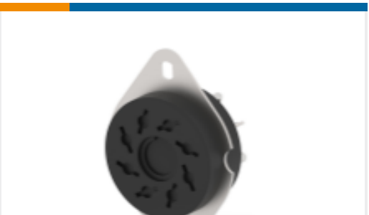
TE Part #7-1415043-1 MT78612