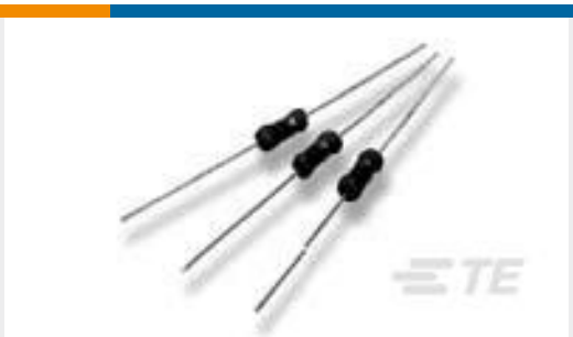
TE Part #6-1625890-5 2W SM M/OX 5% 68K