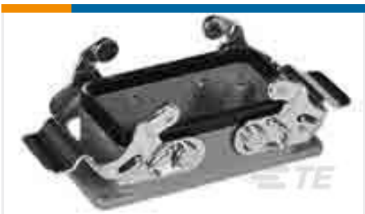
TE Part #1-1102291-1 HB.24.AG-VS