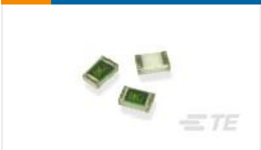
TE Part #1676669-2 RN 0805 22R1 0.1% 10PPM 1K RL