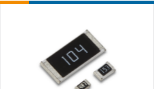
TE Part #3-2176337-6 CRGCQ 0402 8K2 1%