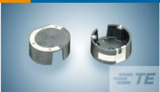
TE Part #1513164-1 MOLDED STAMPED ANTENNA