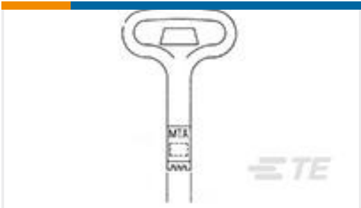
TE Part #59804-1 MAINTENANCE TOOL