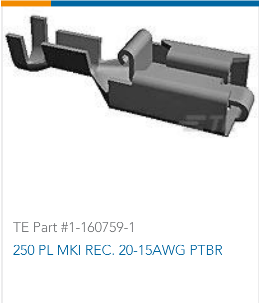
TE Part #1-160759-1 250 PL MKI REC. 20-15AWG PTBR