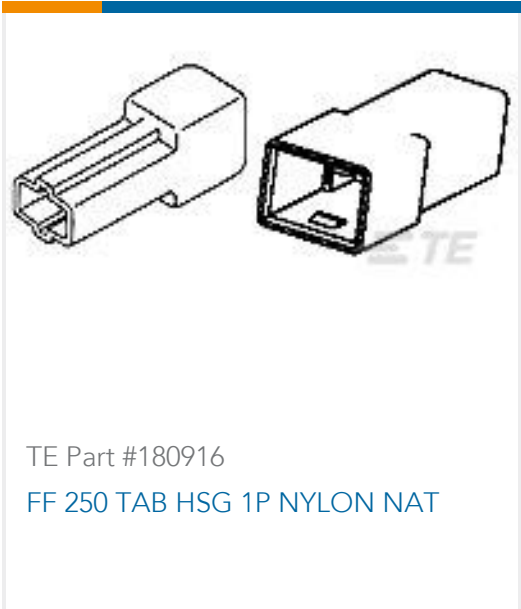
TE Part #180916 FF 250 TAB HSG 1P NYLON NAT