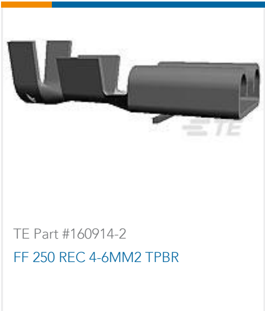
TE Part #160914-2 FF 250 REC 4-6MM2 TPBR