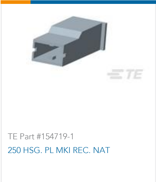
TE Part #154719-1 250 HSG. PL MKI REC. NAT