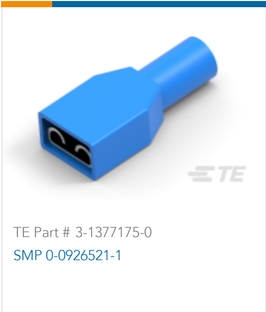
TE Part # 3-1377175-0 SMP 0-0926521-1