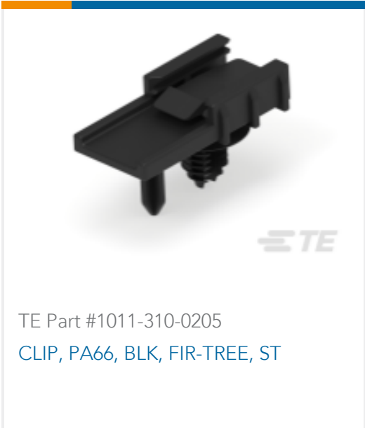
TE Part #1011-310-0205 CLIP, PA66, BLK, FIR-TREE, ST