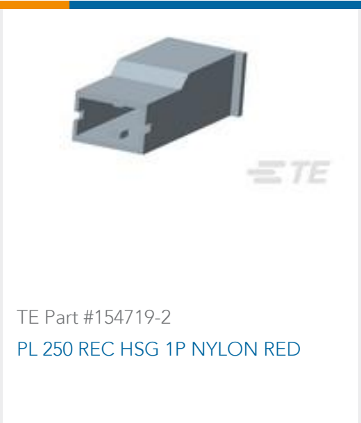
TE Part #154719-2 PL 250 REC HSG 1P NYLON RED