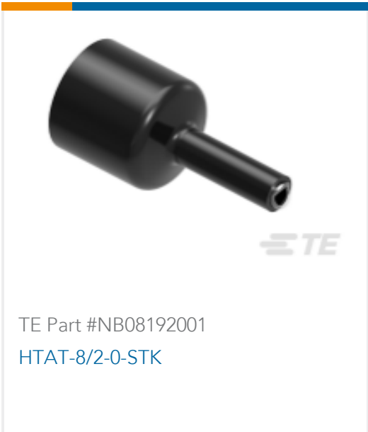
TE Part #NB08192001 HTAT-8/2-0-STK