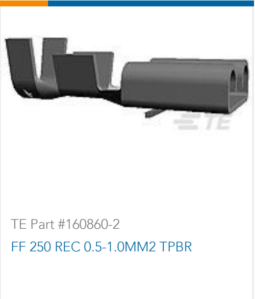
TE Part #160860-2 FF 250 REC 0.5-1.0MM2 TPBR