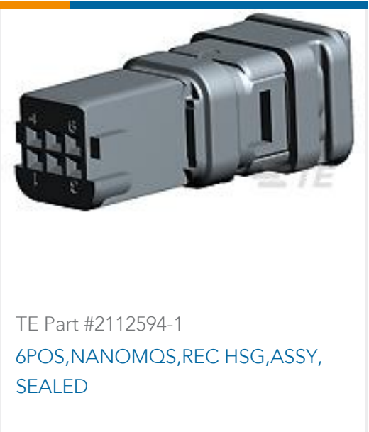
TE Part #2112594-1 6POS,NANOMQS,REC HSG,ASSY, SEALED