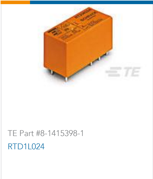
TE Part #8-1415398-1 RTD1L024