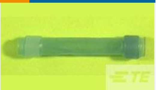
TE Part #650027-000 D-436-73