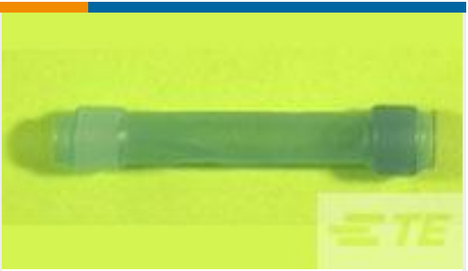
TE Part #650136-000 D-436-0096