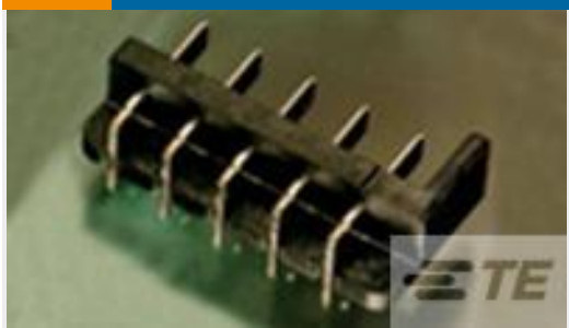
TE Part #5787246-1 HDR ASY,RA,LKEY,STR TAIL,10.8V