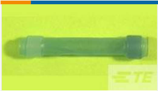
TE Part #650138-000 D-436-0098