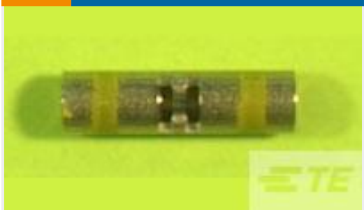
TE Part #680329-000 D-609-09