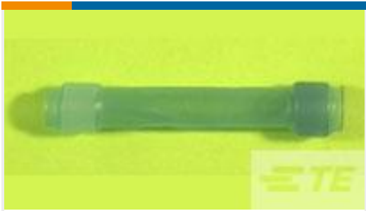
TE Part #650137-000 D-436-0097